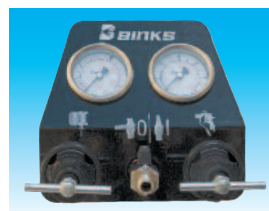
Easy to use controls